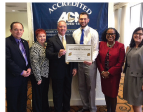
100% New Castle Correctional Facility