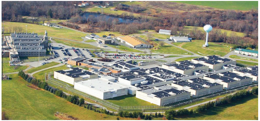
GEORGE W. HILL CORRECTIONAL FACILITY, THORNTON, PA