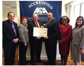
99.8% Queens Detention Facility