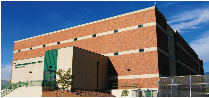
CHEYENNE MOUNTAIN REENTRY CENTER, COLORADO SPRINGS, CO