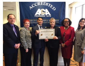
100% Pine Prairie Correctional Center