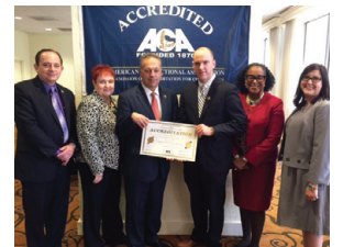
100% Newark Center