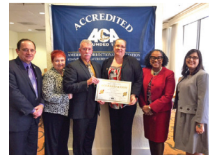
99.8% Great Plains Correctional Facility