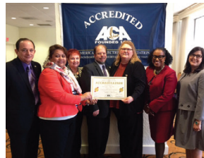
100% Midtown Center