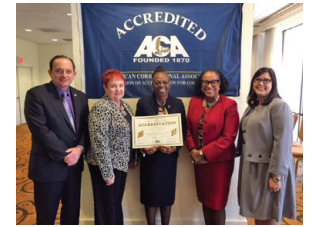
100% Bronx Community Reentry Center