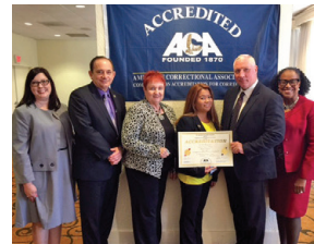
99.8% Adelanto Detention Facility