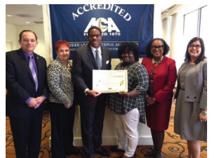
100% South Bay Correctional Facility