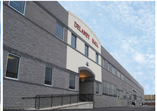
DELANEY HALL, NEWARK, NJ