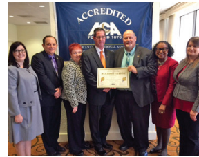
100% Aurora Detention Facility