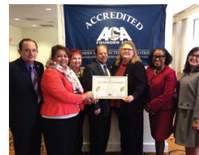
100% Cordova Center