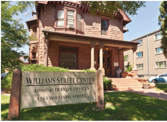
WILLIAMS STREET CENTER, DENVER, CO