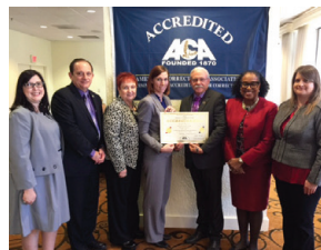
100% Mesa Verde Detention Facility