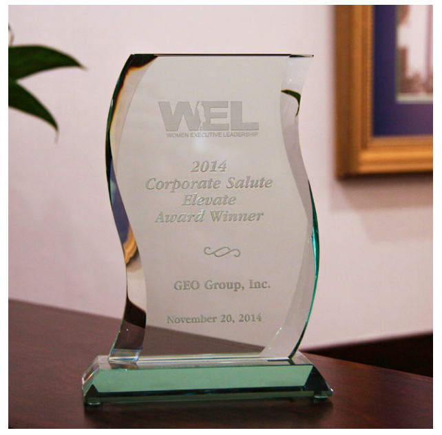
In 2014, GEO was recognized by Women Executive Leadership as a Corporate Salute Award winner for outstanding commitment to gender diversity, by having two or more women on the Board of Directors.